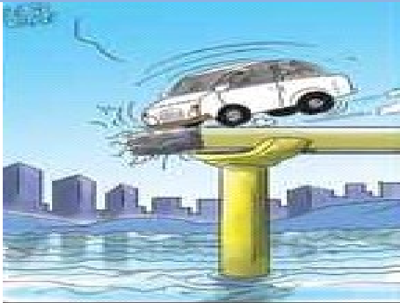
सर, आगे टोल नहीं सीधा ऊपर का टिकट कटने वाला है...

Another important reason for surging prices is that our economists are keen on building and focusing on improving TRADING ECONOMICS, not WELFARE ECONOMICS. Persistent rise in prices of essential commodities is a serious concern for the people’s welfare and productivity, which needs attention. ●