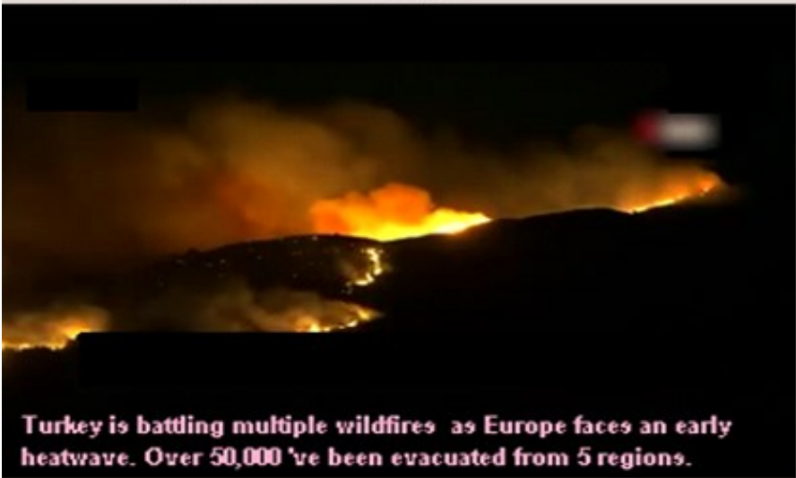
Turkey is battling multiple wildfires as Europe faces an early heatwave. Over 50,000 've been evacuated from 5 regions.

As the climate-change action deadline nears, frequent floods and wildfires are just a forewarning that time is quickly running over growing abhorrent style of living on this planet.