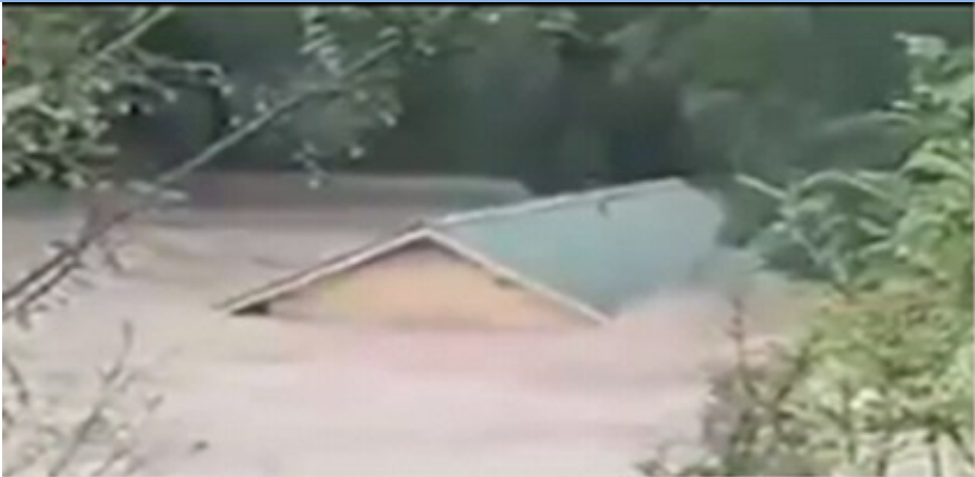
Due to torrential rain, Texas rivers swelled rapidly in just an hour killing hundreds of people.

For attaining statehood, Jammu and Kashmir need to attain peace and resolve conflicting issues within it and its border. A considerable decline and defusing of violence and militant activities will restore peace in the valley, which is a precursor for restoring statehood. ●